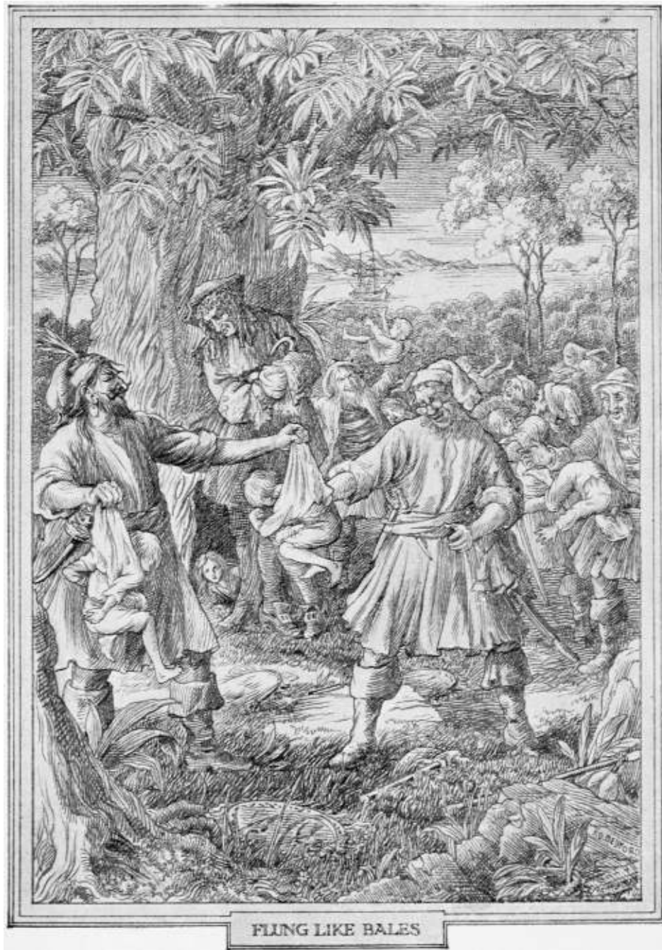
FLUNG LIKE BALES

A different treatment was accorded to Wendy, who came last. With ironical politeness Hook raised his hat to her, and, offering her his arm, escorted her to the spot where the others were being gagged. He did it with such an air, he was so frightfully distingué , that she was too fascinated to cry out. She was only a