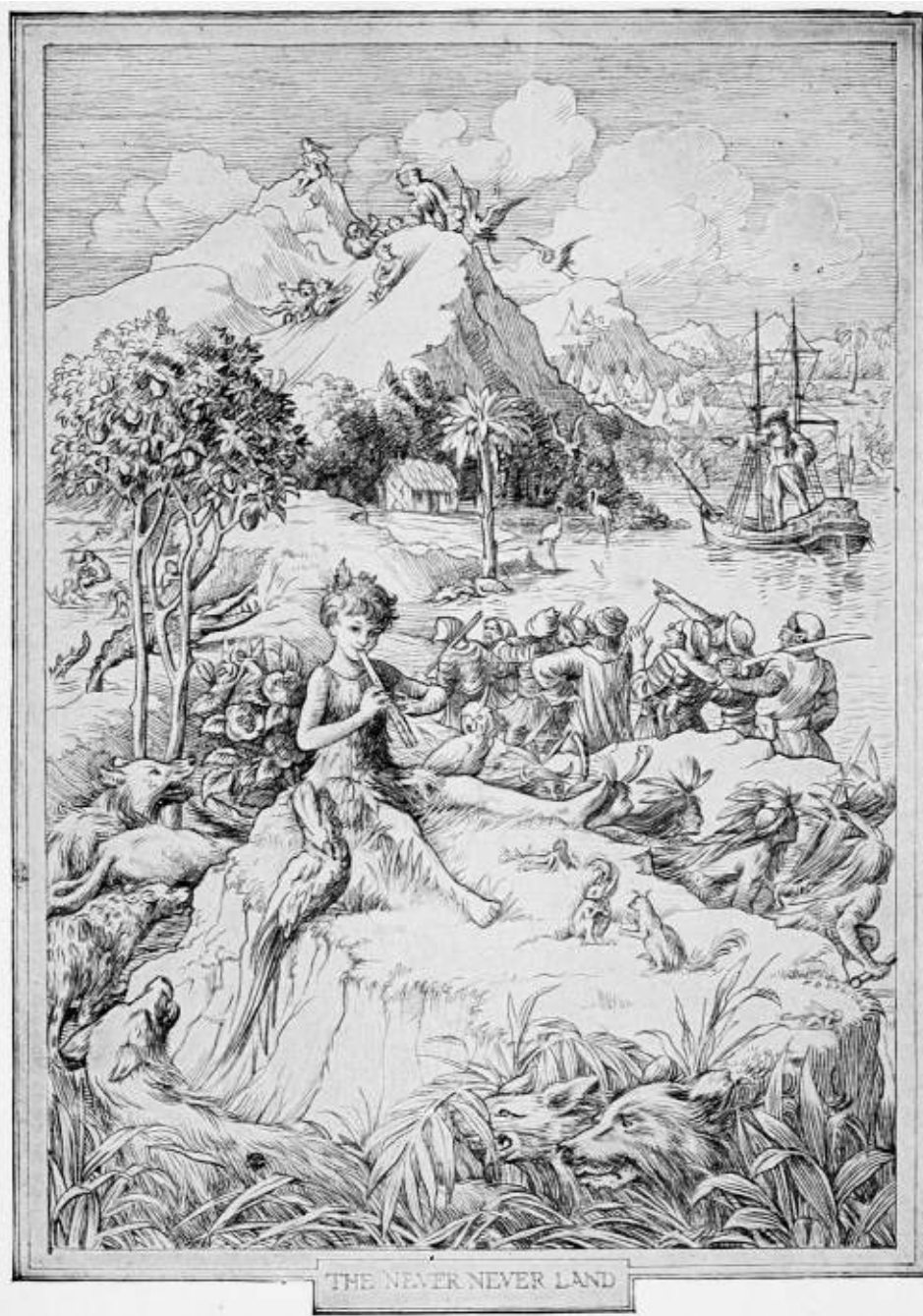
THE NEVER NEVER LAND